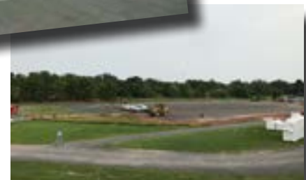
New tennis courts being installed