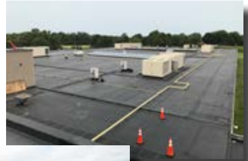
New HVAC rooftop units