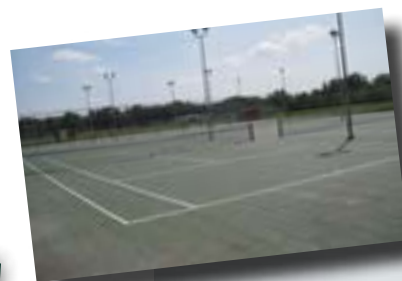
Old tennis courts