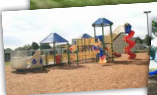
New Elementary playground