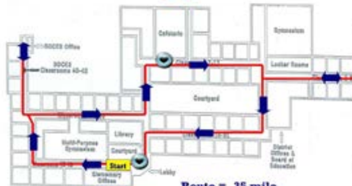
Chart your progress and challenge yourself!

Route = .35 mile 3 times around = 1.05 miles