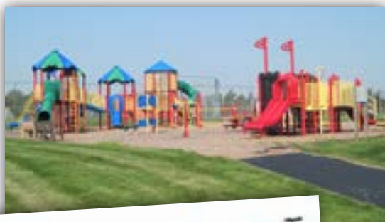
Old Elementary playground