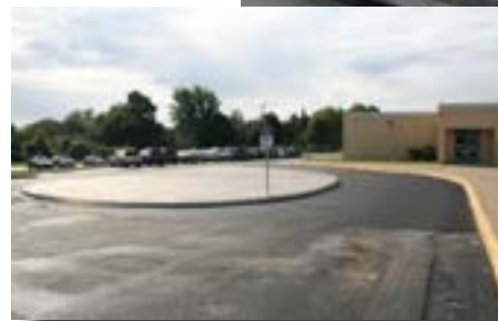
New bus loop at ES