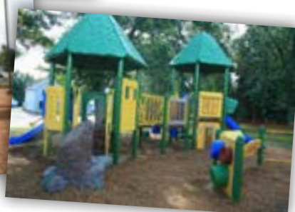
New Pre-K playground