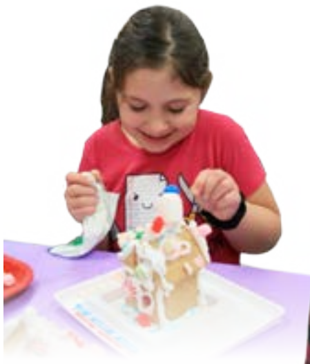
Second graders made gingerbread houses in the Elementary Café on Dec. 19, with help from family members and members of the National Junior Honor Society and Middle School Student Council. Houses were constructed in the morning, left to dry, and then decorated in the afternoon.