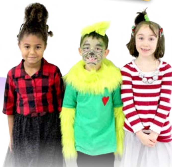
First graders participated in Grinch Day. Here, the Grinch is seen with some members of Whoville.