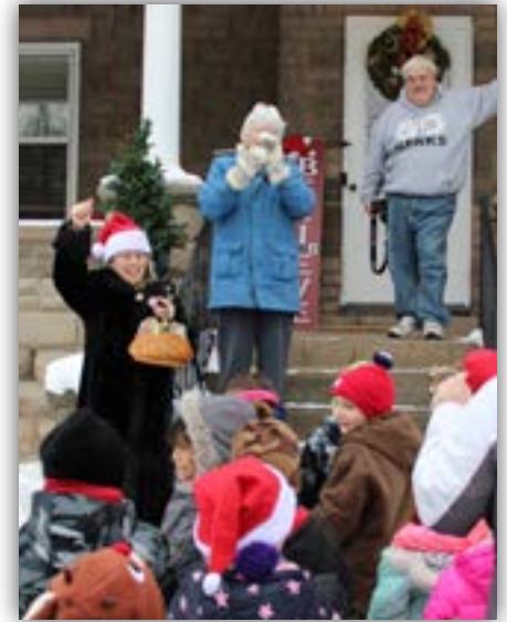
Kindergarteners went caroling through the Village of Holley in December, bringing small treats to residents. Here they are visiting the Heises.