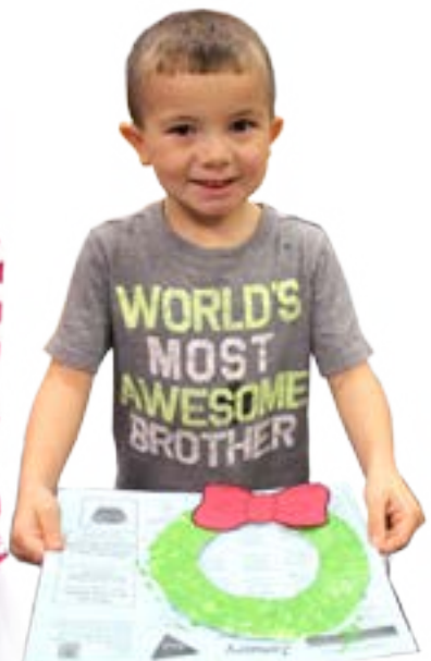
Kindergarten students participated in making holiday crafts.