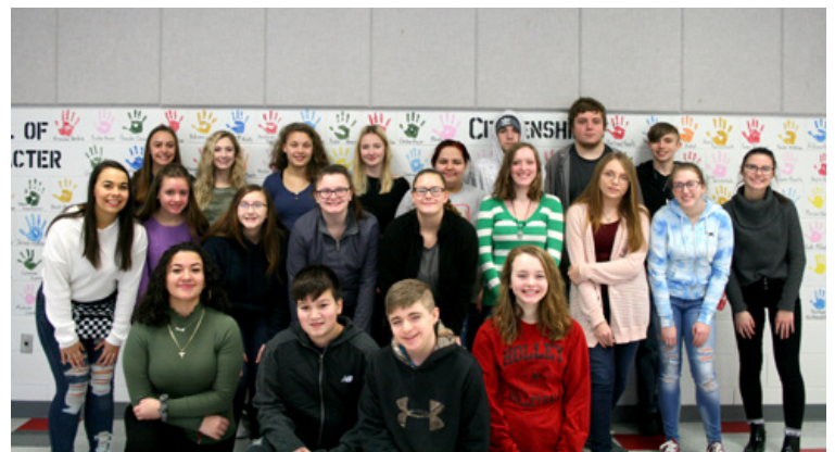
High School Students of the Month for December