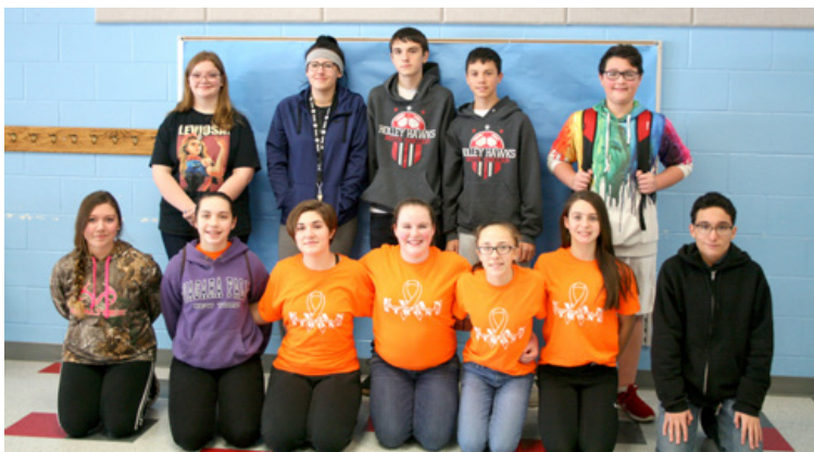
High School Students of the Month for November