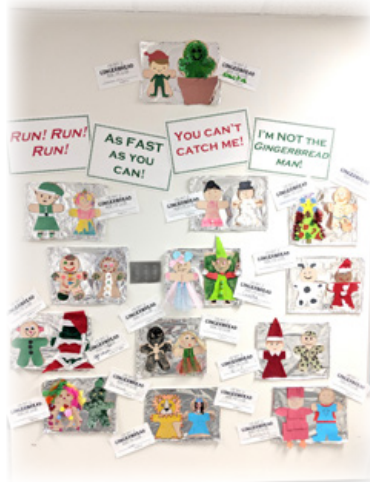
Pre-K students in Amie Callen and Alexa Downey's A.M. and P.M. classes "disguised" their gingerbread men this holiday season and posted the results on the wall outside their classroom.

During the week leading up to the holiday recess, elementary school students participated in Spirit Week. They were able to wear flannels or holiday colors, holiday hats and socks, pajamas, ugly/festive sweaters and/or dress as favorite holiday characters according to the theme of the day. At right are some of their fashion choices.