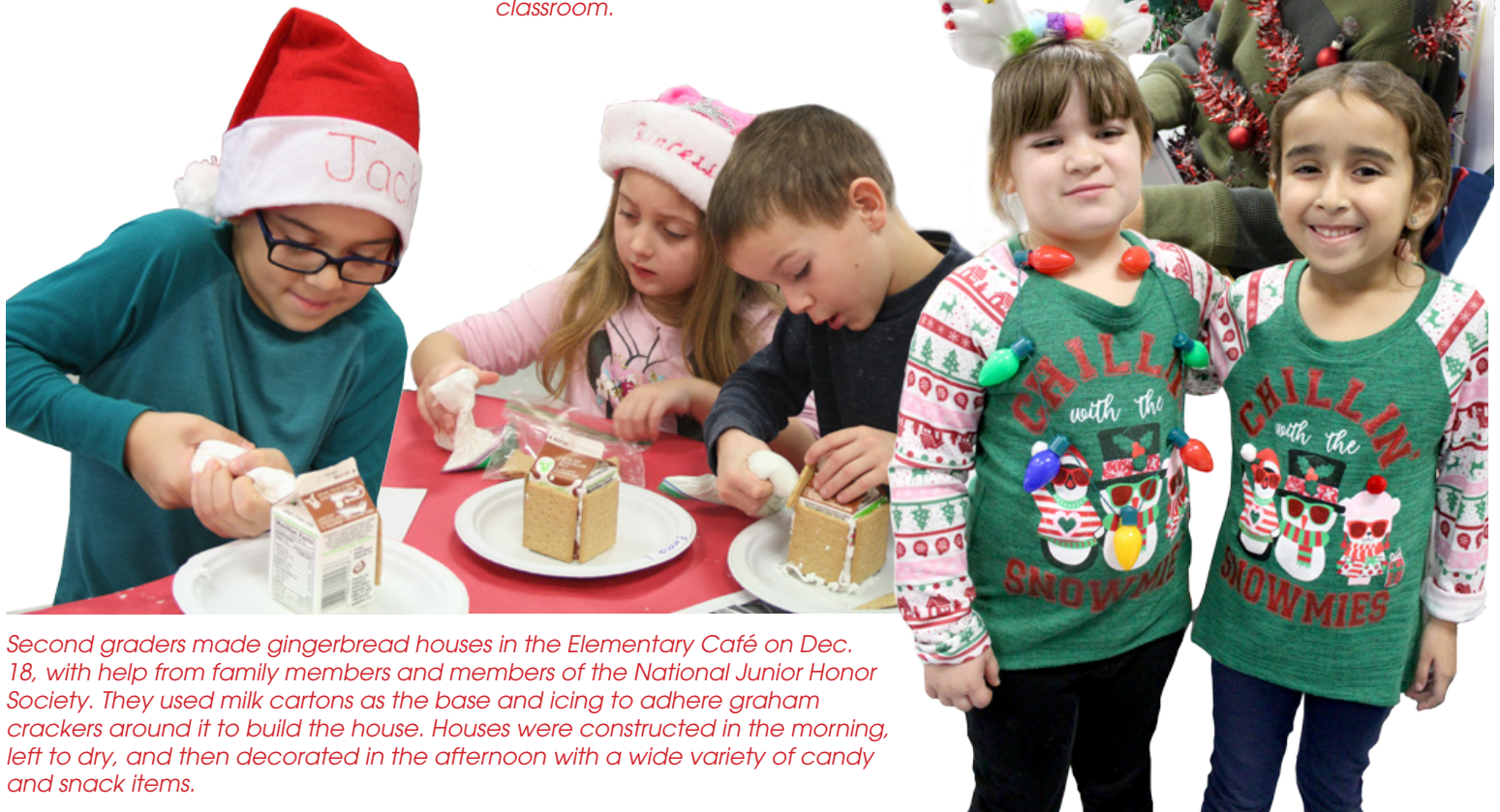
Second graders made gingerbread houses in the Elementary Café on Dec. 18, with help from family members and members of the National Junior Honor Society. They used milk cartons as the base and icing to adhere graham crackers around it to build the house. Houses were constructed in the morning, left to dry, and then decorated in the afternoon with a wide variety of candy and snack items.

During the week leading up to the holiday recess, elementary school students participated in Spirit Week. They were able to wear flannels or holiday colors, holiday hats and socks, pajamas, ugly/festive sweaters and/or dress as favorite holiday characters according to the theme of the day. At right are some of their fashion choices.