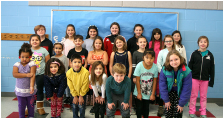
Elementary Students of the Month for November