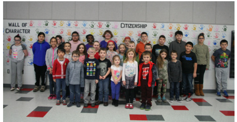
Elementary Students of the month for December