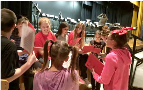
The Elementary Chorus was so excited to participate that they held their own rehearsal on Friday as soon as they arrived at Kendall.

The Holley Elementary Chorus, Middle School Band and High School Chorus participated in the All-County Concert on Saturday, Feb. 3, at Kendall Junior/Senior High School. Their first rehearsal together with students from other Orleans County schools was on Friday, Feb. 2, where they worked with guest conductors to fine-tune the pieces they performed the next day. Students received the music in advance and practiced their parts on their own. The two-day event gave students a chance to interact with other performers from Albion, Kendall, Lyndonville and Medina schools, who may or may not sing the same parts or play the same instruments that they do. It also provided the opportunity for students to learn from another music teacher about how to tackle new material, participate in a large band or chorus, and acquire new skills and techniques from their fellow musicians.